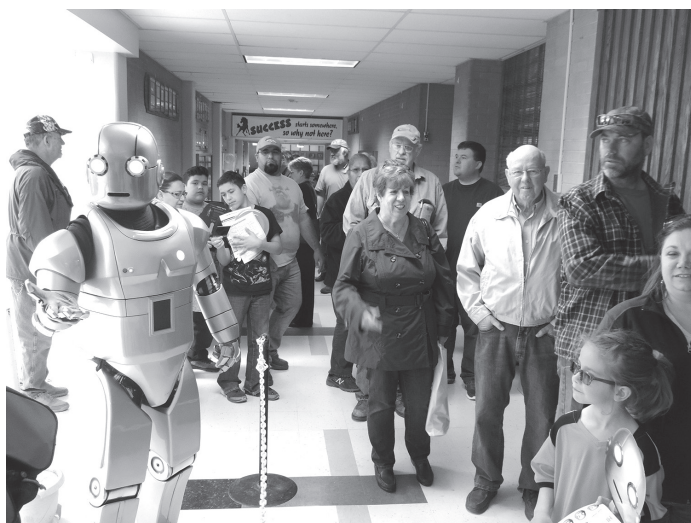
▲ "Power" greets attendees at last year's MCREA Annual Meeting and Member Appreciation.

While the times have changed, our mission and outlook have not. Working together, we can accomplish great things for our members and the communities in our service area — now and in the future.